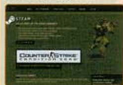
Fancy playing Counter-Strike and Counter-Strike:Condition Zero ? Well head over to the Steam Web site to catch up on all the action

In the past, you used to be able to simply download the software but developer Valve decided to bring out an online software delivery system called Steam. With this installed on your PC, you can easily download and play many games using the system. To get playing, pay a visit to www.steampowered.com/ . You will need a broadband connection to get the most from this service.