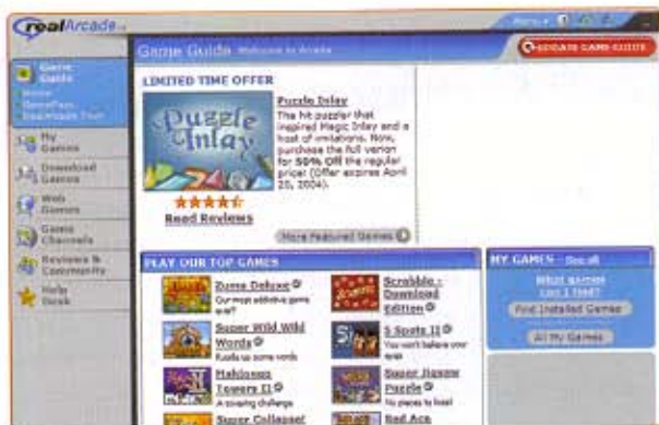
RealArcade enables you to download its very own games browser allowing you to search for games to your heart's content

There are many other sites out there like RealArcade. For example, Electronic Arts has its own games site called Pogo ( www.pogo.com ). There are loads of free games to play on this site and if you are willing to part with the cash, you can even win cash. Like RealArcade, Pogo asks you to sign up for