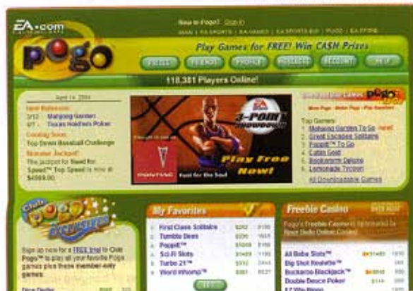
Electronic Arts has a games site called Pogo and you can play cut-down versions of EA favourites

So these are two Web sites for you to investigate in your search for Windows XP gaming