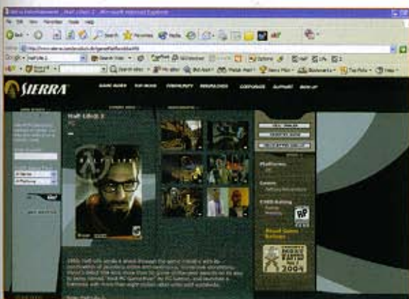
One of the most eagerly-anticipated games of the year is Half-Life 2 from Sierra – order your copy in advance from Amazon and other outlets

A pretty definitive games download site can be found at Gamespot ( http://dlx.gamespot.com/ ). Here you can find demos of all the latest PC games, as well as an archive of old games, just in case there were some you missed. But it doesn't stop there, you can also download game movies, mods (modifications to you and me) for existing games and custom maps. So there's a lot to see and play around with here.