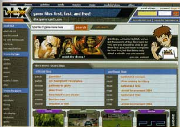
If you are looking for free PC game demos, you can't go wrong by paying a visit to the Gamespot download site

yourself some commercial arcade action? Well, computer games cost anything between £25 and £40 these days, so unless you have really deep pockets or a job at the Bank of England, you could end up spending a small fortune.