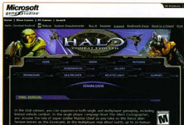
Halo: Combat Evolved was a big game on the Xbox and now you can download the demo from Microsoft

Yahoo! also has its very own demo downloads section at http://gamesdomain.yahoo.com/ , which features gaming movies and demos too. If you're having trouble finding a particular demo or the servers are busy then you'll find what you want at CNET's Download site ( www.download.com ).